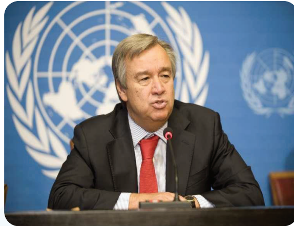
HE, ANTONIO GUTERRES, UNITED NATIONS SECRETARY GENERAL HONORARY PRESIDENT OF THE COUNCIL - UNIVERSITY FOR PEACE (UPEACE)