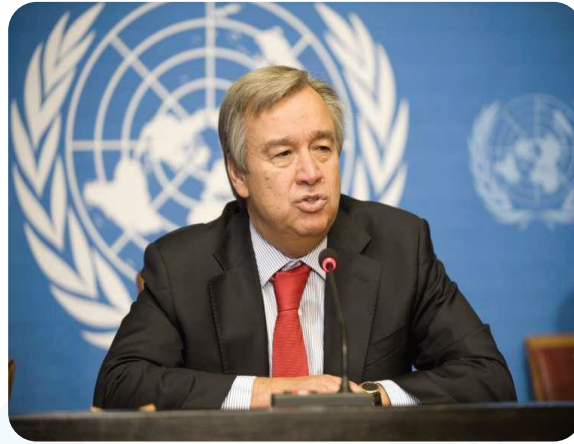
HE, ANTONIO GUTERRES, UNITED NATIONS SECRETARY GENERAL HONORARY PRESIDENT OF THE COUNCIL - UNIVERSITY FOR PEACE (UPEACE)