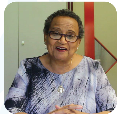
MRS LALLA BEN BARKA KEYNOTE SPEAKER, 2022 COMMENCEMENT

THE UNIVERSITY FOR PEACE (UN MANDATED) WAS ESTABLISHED IN DECEMBER 1980 THROUGH UNITED NATIONS GENERAL ASSEMBLY RESOLUTION 35/55 AS AN INTERNATIONAL HIGHER EDUCATION INSTITUTION FOR PEACE WITH HEADQUARTERS IN COSTA RICA. AS DETERMINED IN THE CHARTER OF THE UNIVERSITY, THE MISSION OF THE UNIVERSITY FOR PEACE IS: