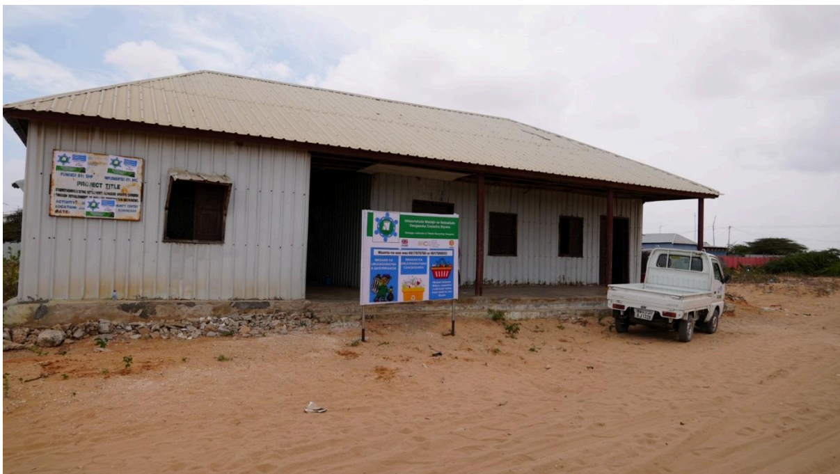
Garbage collection and recycling company in Ceelsha Biyaha

But thanks to a community initiative supported by Cesvi and a local private partner called Africa Solutions, the residents can now safely dispose off their waste and even make money through a rewarding scheme that was purposely developed to encourage them.