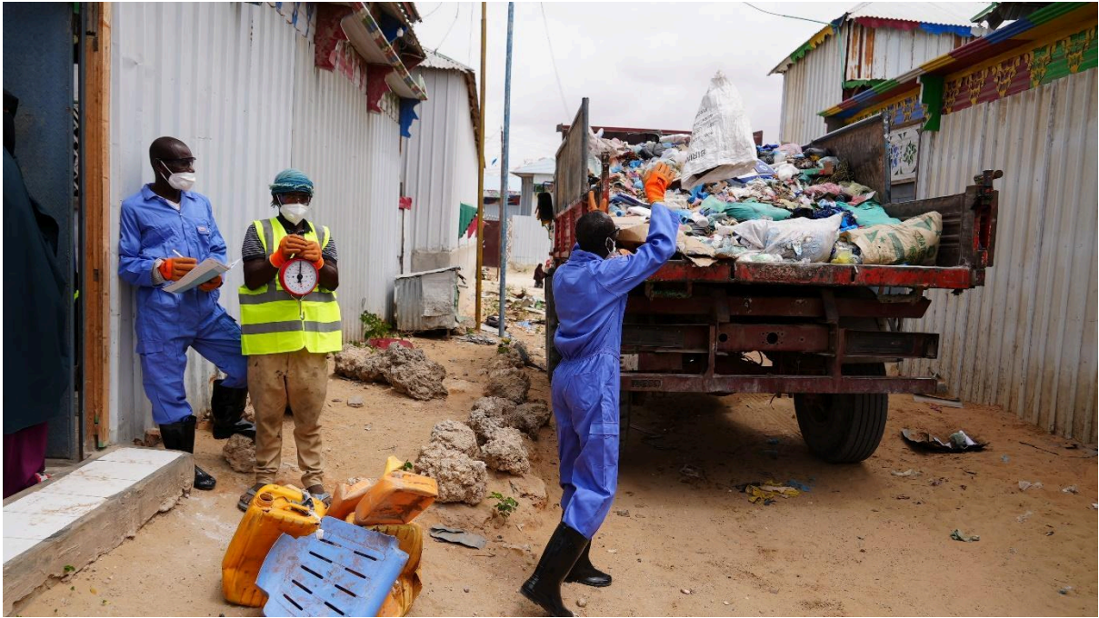
Waste collectors collecting garbage at Ceelasha Biyaha